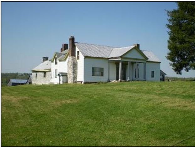
Carry Nation's Home in Garrard County

However, because of Carry Nation's efforts as an anti-alcohol, saloon-smashing, early proponent of women's suffrage---Garrard County, Kentucky ---where Carry Nation was born--- is known ---as the "Birthplace of Prohibition."